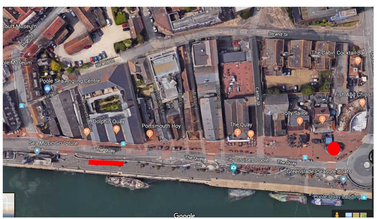
Trading areas marked in red.